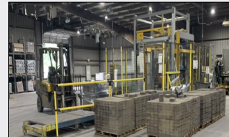
Block & Tile Production